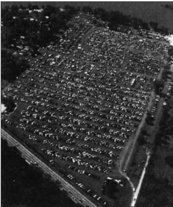
AERIAL VIEW OF AUTORAMA